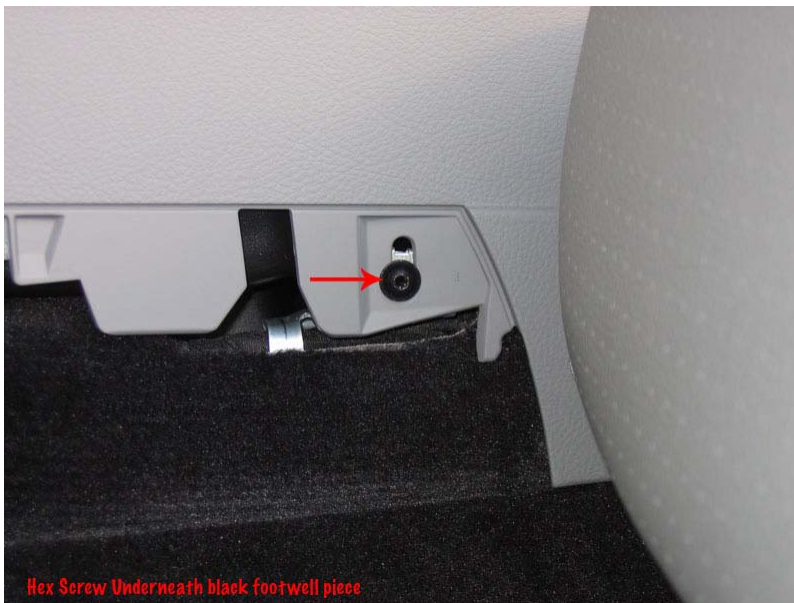
Hex Screw Underneath black footwell piece

1.4 Slide the front seat(s) as far forward and upward as possible. Moving to the rear seat, locate the oblong screw cover and remove it along with the T20 screw behind it.