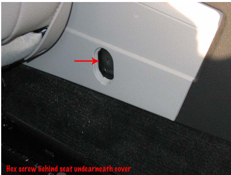
Hex screw behind seat underside cover

1.4 Slide the front seat(s) as far forward and upward as possible. Moving to the rear seat, locate the oblong screw cover and remove it along with the T20 screw behind it.