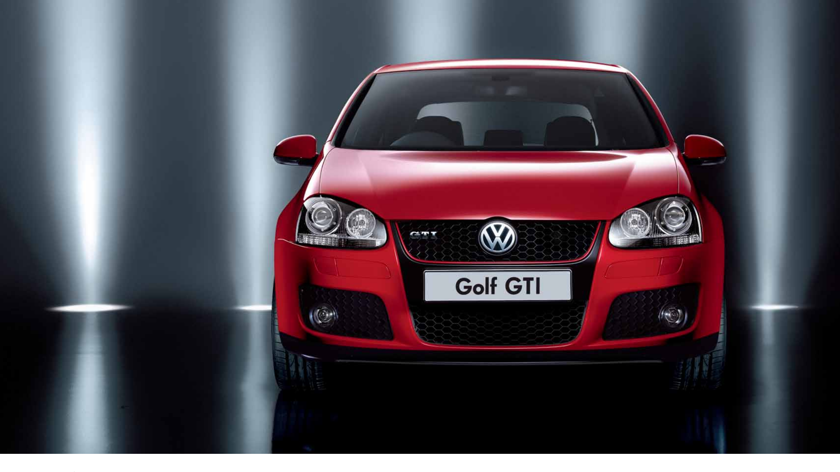
The Golf GTI with optional Xenon headlights.