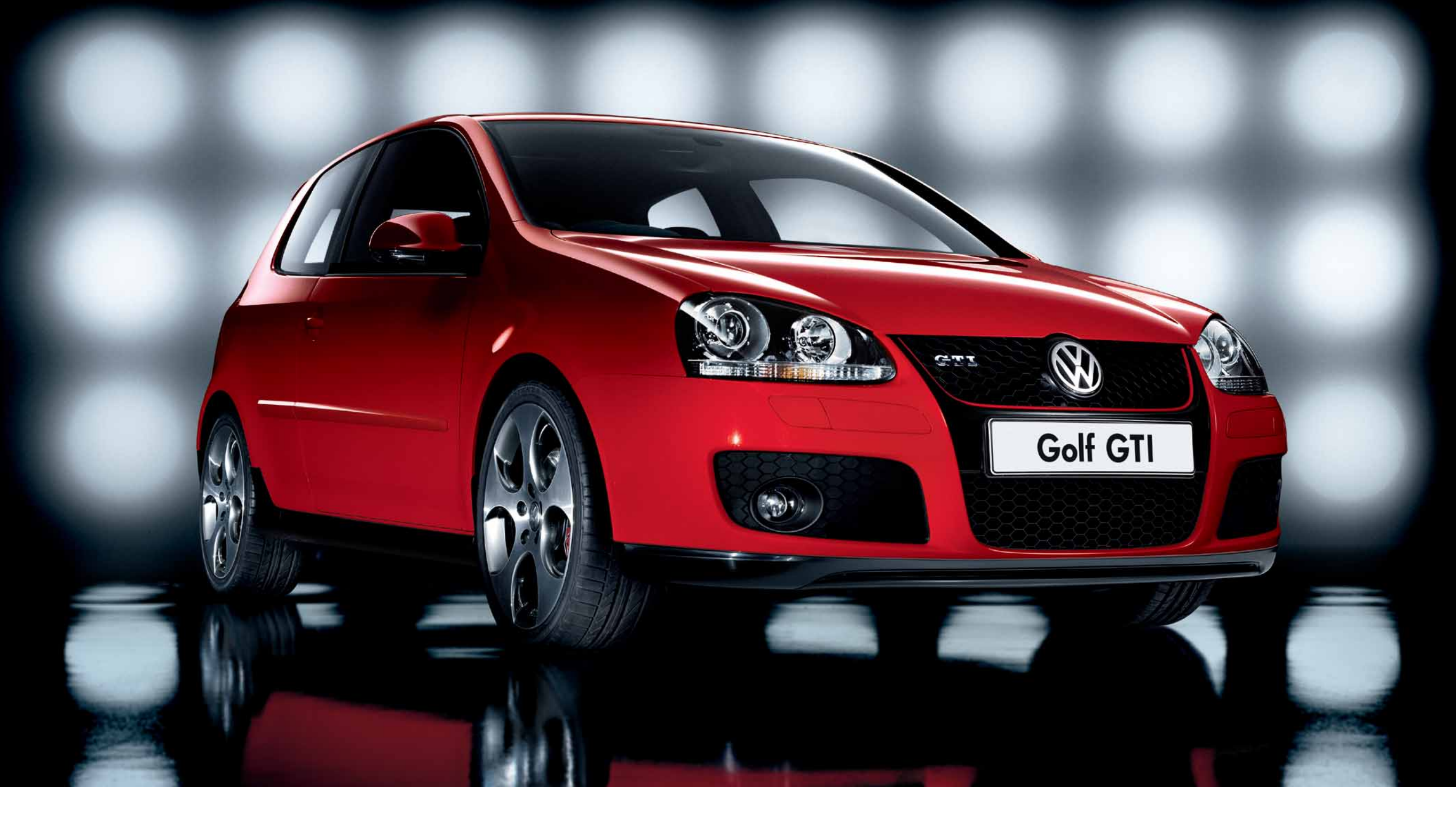
The Golf GTI with optional 18" 'Monza II' alloy wheels and Xenon headlights.