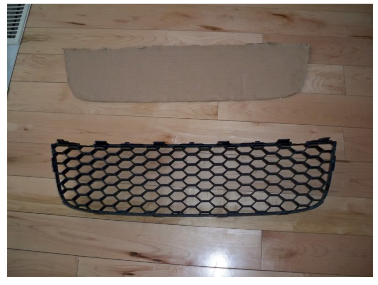
4)place the pice u cut over the gill and push down all coners