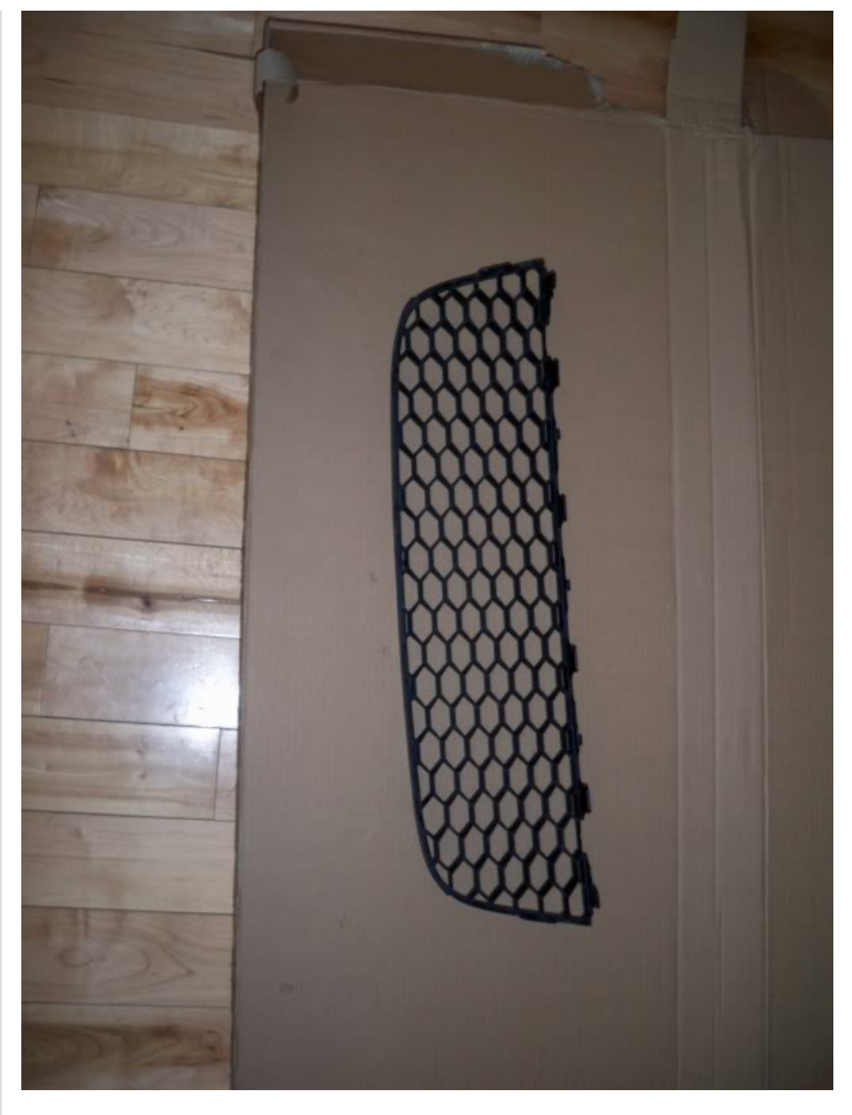
3)cut out the shape of the grill