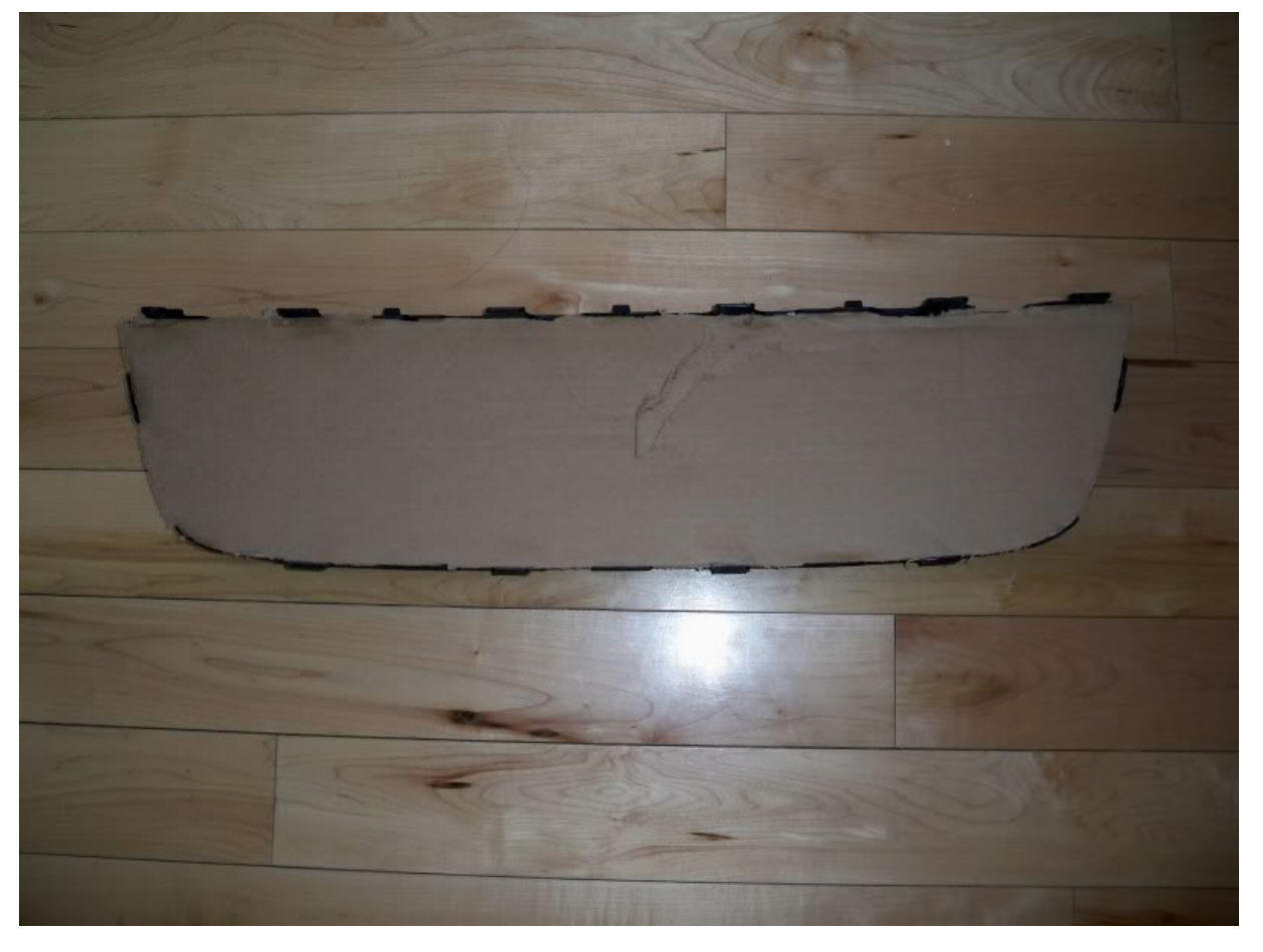
5) make little holes and use zip-ties to hold the cardboard over the honeycomb