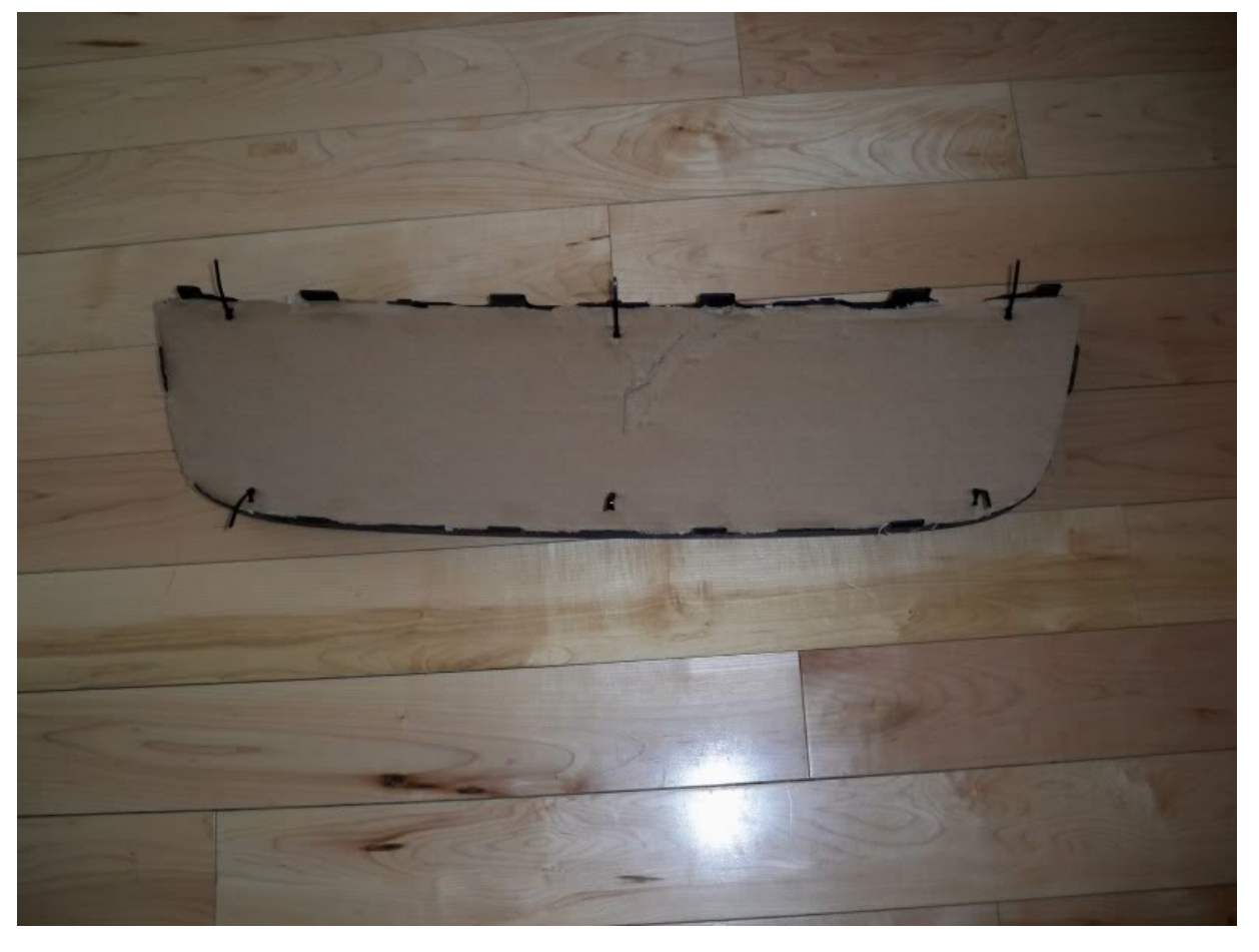
6)put the grill back and push in all the tabs and VOILA!!!