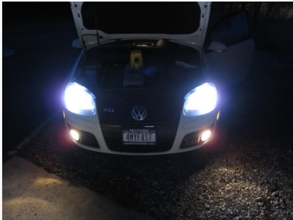
ALL LIGHTS ON CAPTAIN