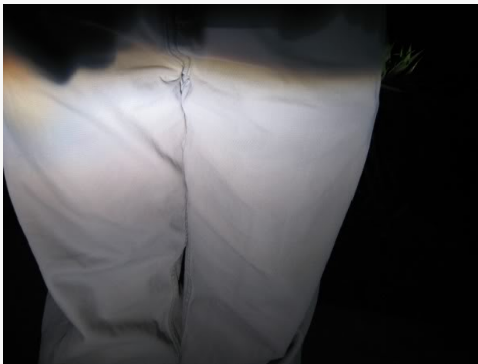
Stock left, Ultinon right...