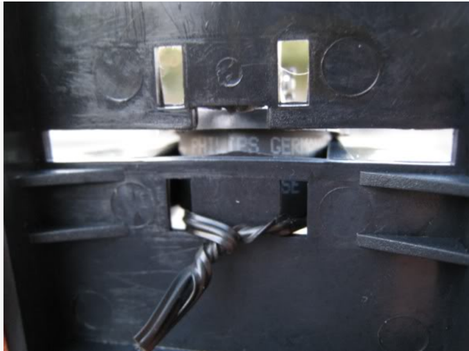
2. Unscrew black cover