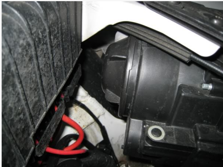
3. Rotate to open - don't worry this does not hold the bulb in. When you rotate it to open, the black connector will pop itself off. You can not plug it back in until its reinstalled so don't try!