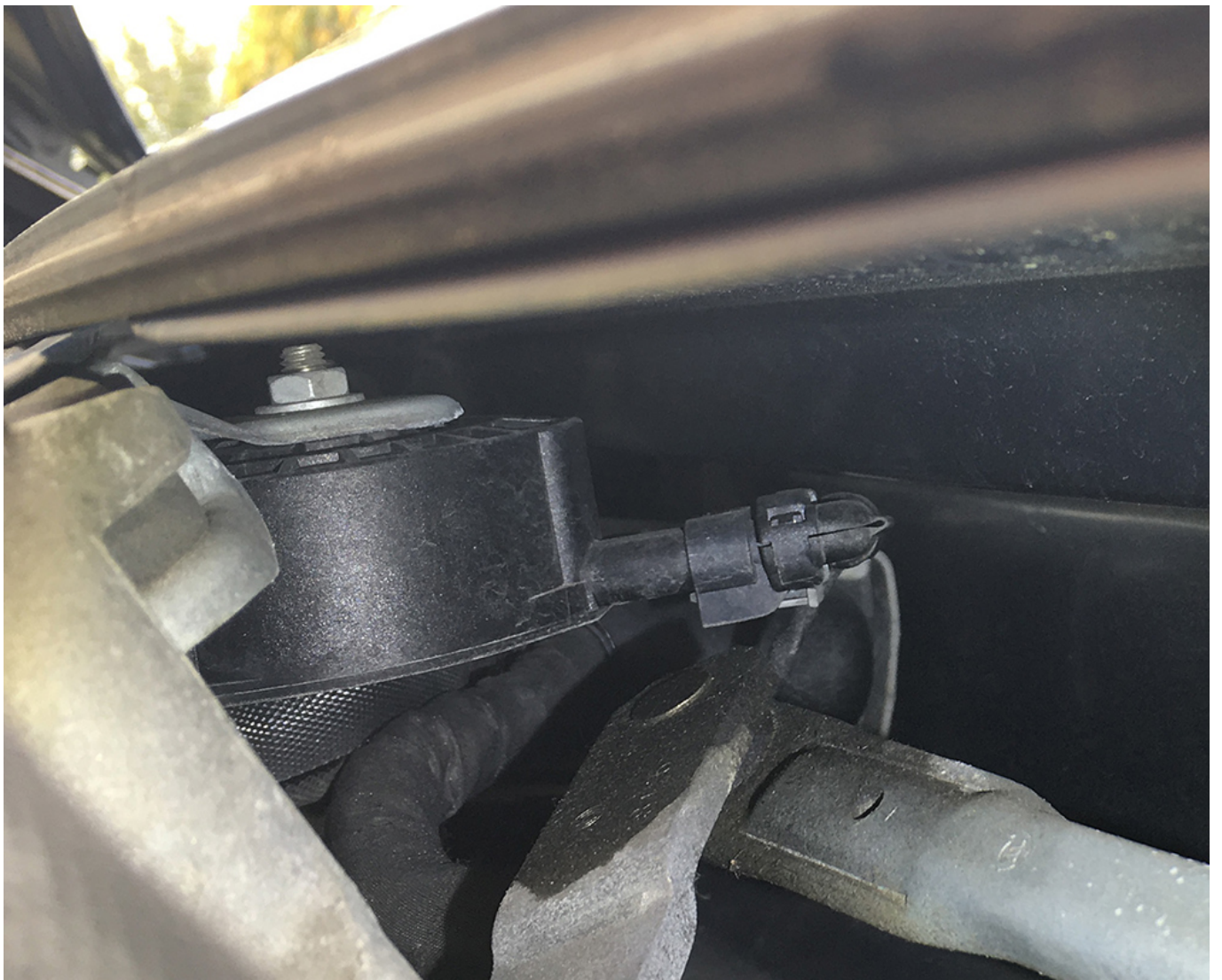
Closeup of the Soundaktor plug.