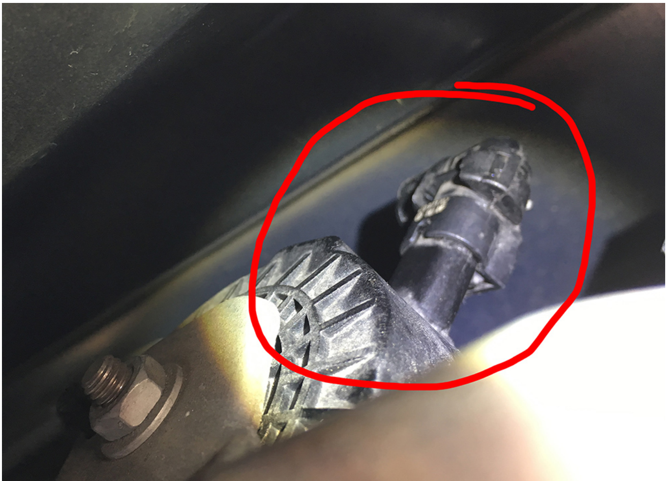
Another closeup of the Soundaktor and plug.